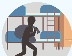
THEFT IN DWELLING