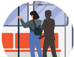
OUTRAGE OF MODESTY