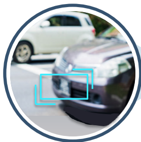
Vehicle License Plate Recognition System