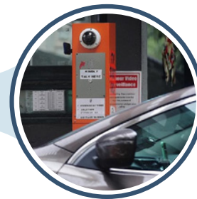
Visitor Management System Application