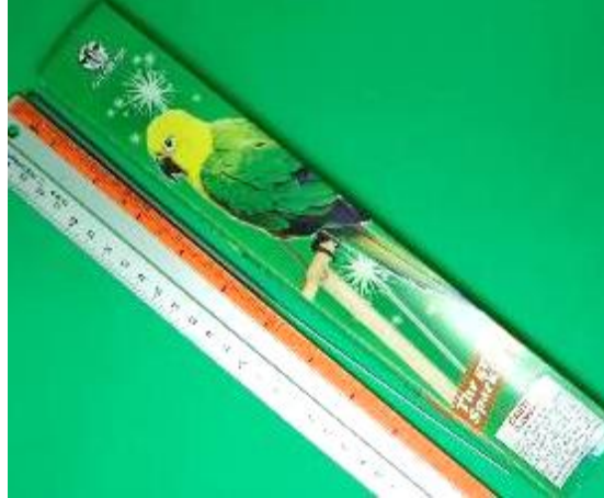
Cock Brand Magic Whistling Sparklers Article No.9910