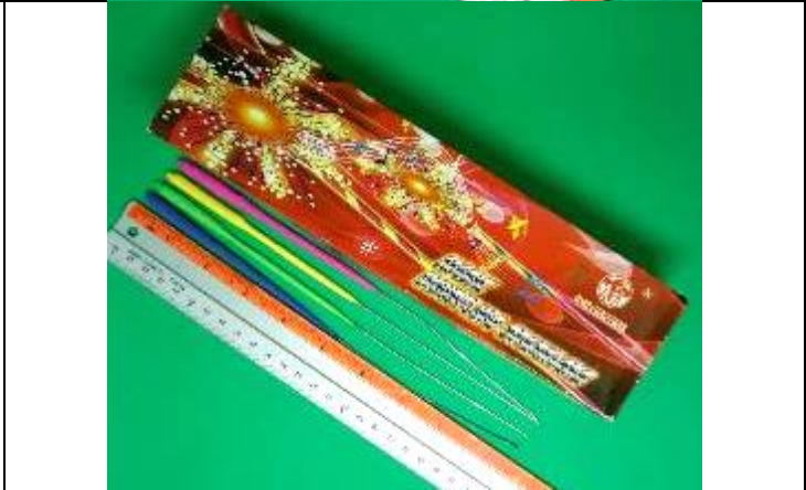
Golden Bee Brand Low Smoke Golden Sparklers