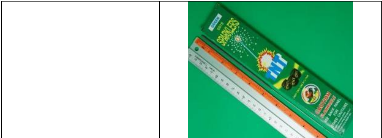
Golden Bee Brand Magic Whistling Sparklers