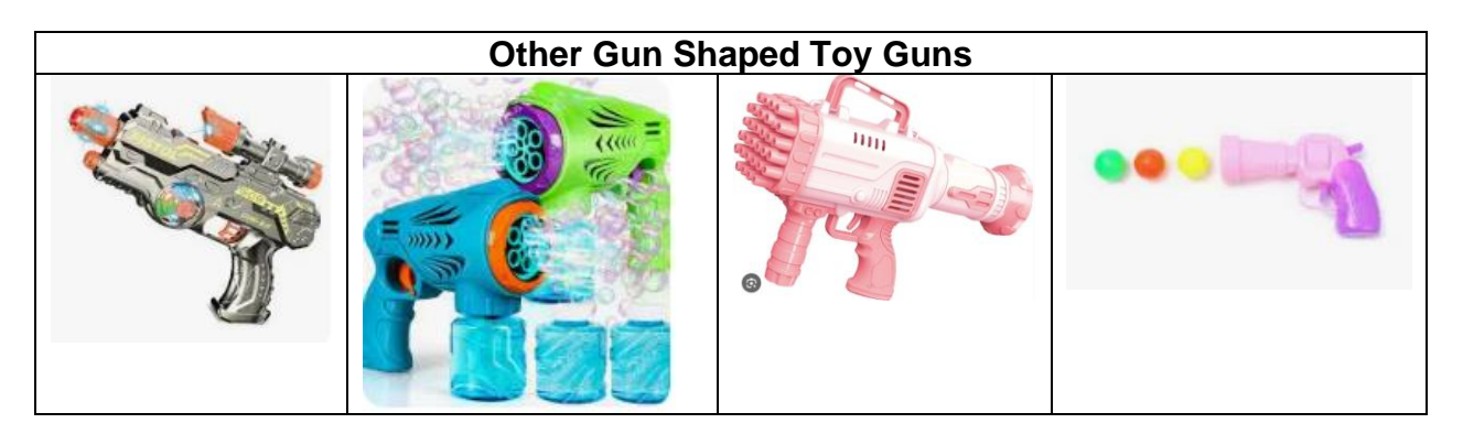
Updated 11 April 2025