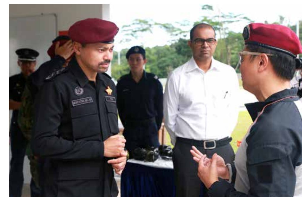
His Royal Highness (left) receiving a briefing from a Home Team officer standing next to Minister of State, Ministry of Communication and Information and Ministry of Education Dr Janil Puthuchearry (centre).

The Home Team Tactical Centre (HTTC) played host to His Royal Highness Prince Haji Al-Muhtadee Billah ibni His Majesty Sultan Haji Hassanal Bolkiah Mu'izzaddin Waddaulah, The Crown Prince and Senior Minister at the Prime Minister's Office of Brunei Darussalam during his visit to Singapore on 30 November 2016.