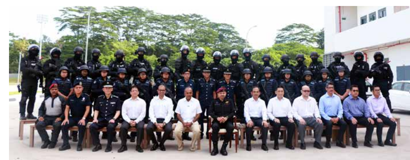
His Royal Highness (centre) and Minister for Home Affairs and Minister for Law Mr K Shanmugam (sitting, sixth from left) posing for a group photo at the Home Team Tactical Centre.

During his visit to the HTTC, His Royal Highness, who is also Deputy Inspector General of the Royal Brunei Police, watched a counter-terrorism demonstration conducted by the Singapore Police