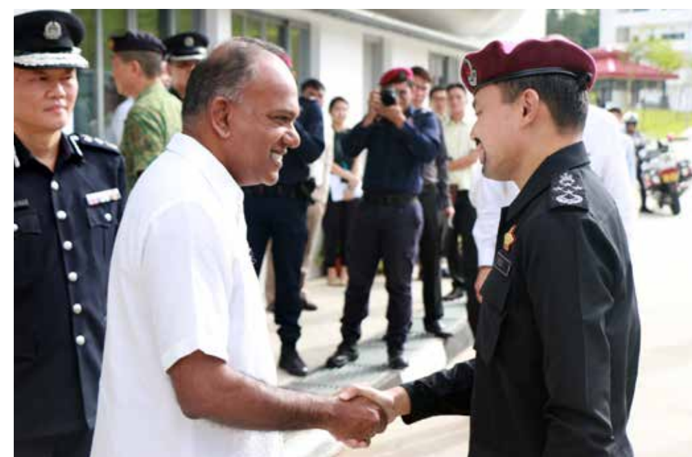
Minister for Home Affairs and Minister for Law Mr K Shanmugam (left) greeting His Royal Highness during his visit to the Home Team Tactical Centre.

His Royal Highness Prince Haji Al-Muhtadee Billah ibni His Majesty Sultan Haji Hassanal Bolkiah Mu'izzaddin Waddaulah, The Crown Prince and Senior Minister at the Prime Minister's Office of Brunei Darussalam visited the Home Team Tactical Centre on 30 November 2016. During his visit, he observed a counter-terrorism demonstration conducted by the Singapore Police Force. His Royal Highness, who was received by Minister for Home Affairs Mr K Shanmugam, is in Singapore for a six-day visit as part of the 4th Singapore-Brunei Young Leaders' Programme.