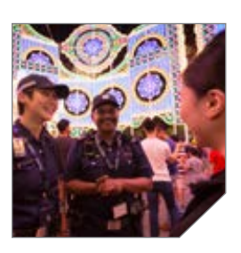
12 Commercial Partners