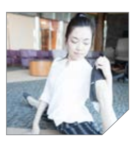
15 One of Us