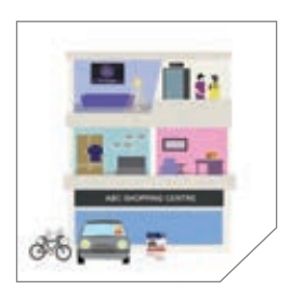
14 By the Numbers