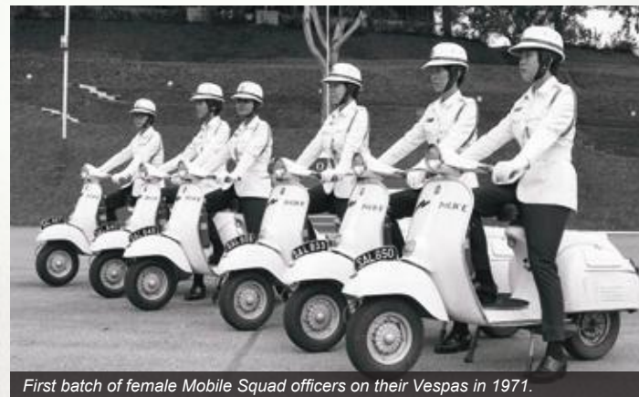
First batch of female Mobile Squad officers on their Vespas in 1971.

Another area where female officers played an active role was in the Traffic Police. They were originally deployed as traffic wardens and later as enforcers. Although the work was limited, it was one of the few early avenues for female officers to be seen in public carrying out police duties. In 1971, female Traffic Police officers broke into another all-male domain when the female mobile squad was formed despite initial concerns that it was unfeminine for women to ride motorbikes.