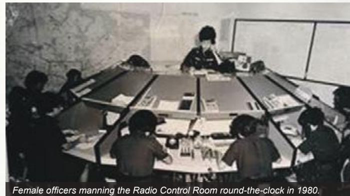
Female officers manning the Radio Control Room round-the-clock in 1980.

Despite being confined to mostly clerical work, female officers made their mark where they were deployed and gradually became an indispensable part of the Force. In 1964, 15 female officers were deployed to the Radio Control Room at Pearl's Hill for the first time. At the nerve centre of police operations, these officers answered '999' calls, produced reports, and dispatched patrol cars via radio to respond to crimes – all without the aid of modern automated systems. Female officers proved so effective at the job that the management of the entire Radio Control Room, save for the Duty Officer and Assistant Duty Officer, was eventually handed over to them in 1972. Those who answered '999' calls came to be known as "Triple Niner Girls".