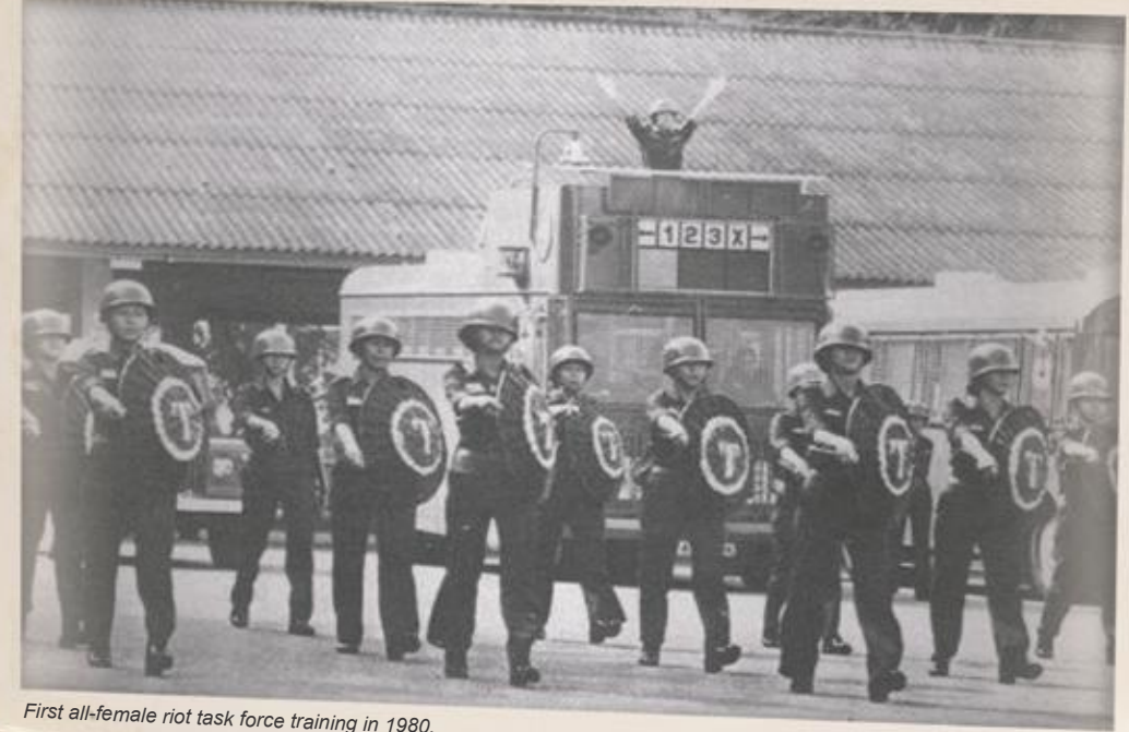
First all-female riot task force training in 1980.