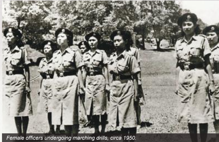
Female officers undergoing marching drills, circa 1950.

With these considerations in mind, then-Commissioner of Police, R. E. Foulger, inaugurated the women police in 1949 as part of the Special Constabulary (Active Unit). The contribution of the first female officers proved to be so valuable that they began to be absorbed into the regular force in 1950. To further enhance their effectiveness, the initial two months of training was increased to three months in 1949 and six months by the 1960s, which was on par with the training for male officers.