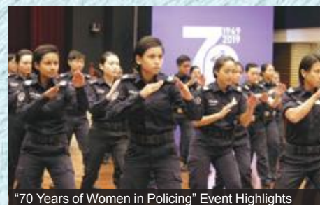
"70 Years of Women in Policing" Event Highlights

Scan the QR code to watch the event highlights: