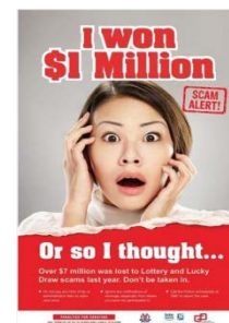
Image: Examples of Scam Posters