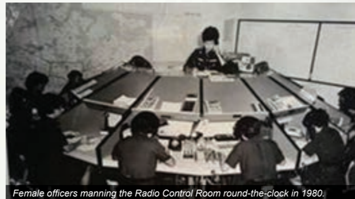
Female officers manning the Radio Control Room round-the-clock in 1980.

Despite being confined to mostly clerical work, female officers made their mark where they were deployed and gradually became an indispensable part of the Force. In 1964, 15 female officers were deployed to the Radio Control Room at Pearl's Hill for the first time. At the nerve centre of police operations, these officers answered '999' calls, produced reports, and dispatched patrol cars via radio to respond to crimes – all without the aid of modern automated systems. Female officers proved so effective at the job that the management of the entire Radio Control Room, save for the Duty Officer and Assistant Duty Officer, was eventually handed over to them in 1972. Those who answered '999' calls came to be known as "Triple Niner Girls".