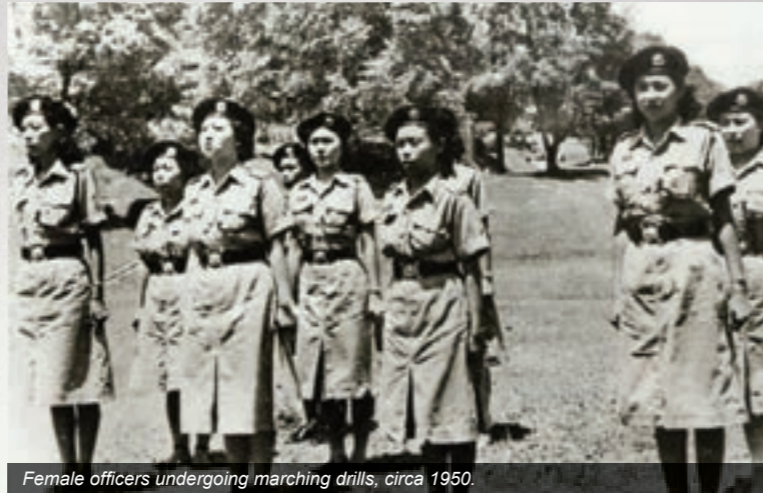
Female officers undergoing marching drills, circa 1950.

With these considerations in mind, then-Commissioner of Police, R. E. Foulger, inaugurated the women police in 1949 as part of the Special Constabulary (Active Unit). The contribution of the first female officers proved to be so valuable that they began to be absorbed into the regular force in 1950. To further enhance their effectiveness, the initial two months of training was increased to three months in 1949 and six months by the 1960s, which was on par with the training for male officers.