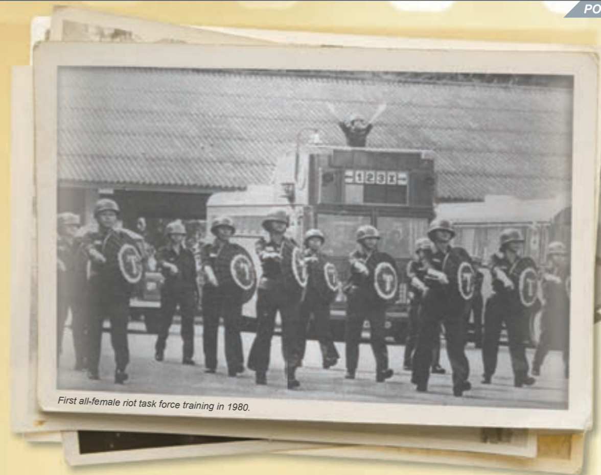
First all-female riot task force training in 1980.