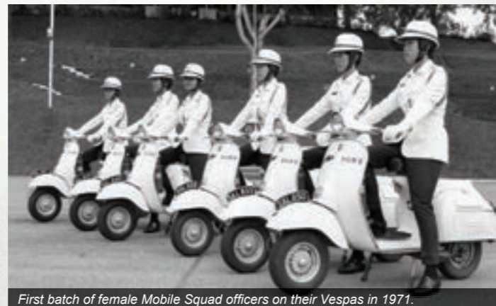
First batch of female Mobile Squad officers on their Vespas in 1971.

Another area where female officers played an active role was in the Traffic Police. They were originally deployed as traffic wardens and later as enforcers. Although the work was limited, it was one of the few early avenues for female officers to be seen in public carrying out police duties. In 1971, female Traffic Police officers broke into another all-male domain when the female mobile squad was formed despite initial concerns that it was unfeminine for women to ride motorbikes.